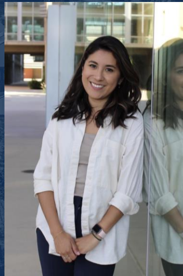
Academic Advisor, Student Engagement Coordinator