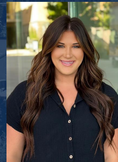
Student Services Assistant