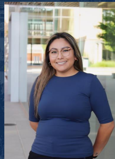
Academic Advisor, Degree Completion Program