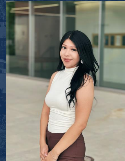
Academic Advisor, Academic Success Coordinator