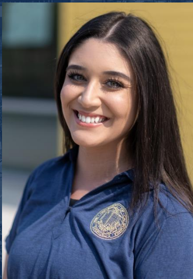
Academic Advisor, Transfer Coordinator