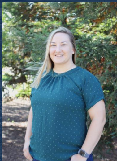
Academic Advisor, Degree Completion Program