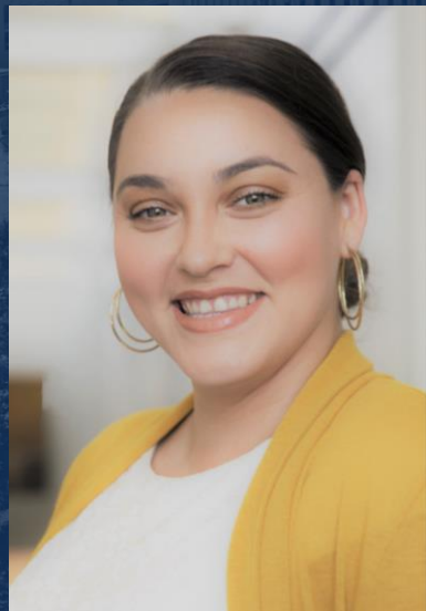
Senior Academic Advisor, Student Success Coordinator