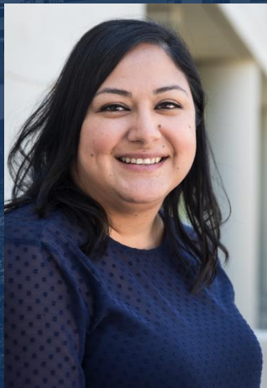
Director of Student Services